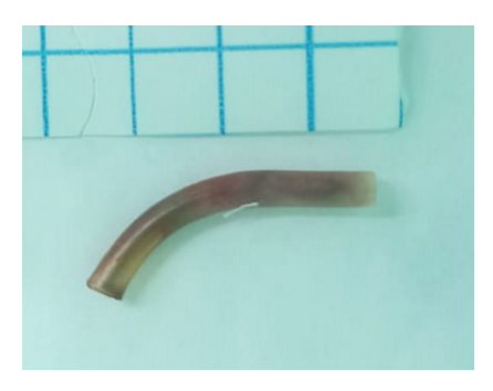
Figure 3. The extracted fractured tracheal cannula

After the operation, the patient was confined in the ICU and then, transferred to a regular ward after his condition had stabilized. Antibiotic, mucolytic, analgesic, and nebulization were administered during the treatment. After improvement of general condition and symptoms, the patient was discharged from the hospital on the 7th day after the procedure. Education regarding the supervision, follow up and post-tracheostomy care was given to the parents.